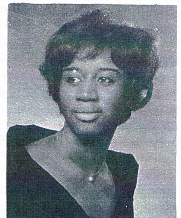
MOST TALENTED GIRL